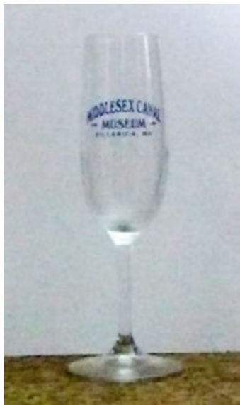
Champaign Glass utilized to “toast” at the dedication of the Middlesex Canal Museum and Visitors Center.

Several of our volunteers worked on grant requests in varying amounts and were successful in each attempt. Grant writing was a large portion of the funds used to run the Museum. We had the strong backing our Town Managers, Select Boards, Recreation Dept. We all continued to fund raise and advertise what events were being held at the museum. What fun we volunteers had putting on fundraiser “teas”, working with Lowell National Historical Park rangers each Yankee Doodle with new, creative ideas to showcase the Canal that the townspeople really enjoyed. We also celebrated Canal Days tours each summer, Riverfest each July, Faulkner Mills hosting a “block party” with DJ and hot dogs. And yard sale fund raisers. We also walked yearly in the Chelmsford 4th of July parade pulling the exhibit of the packet boat, while in full 1800th century costumes (and let me tell you it was very hot) to hand out flyers and publicize the Museum. We also did this for Billerica’s Yankee Doodle parade. Then there was “Ladies Night Out” as a fundraiser. Boy Scout Troop 55 was helpful on many occasions with brush clearing on the towpaths, general cleaning for a special occasion.